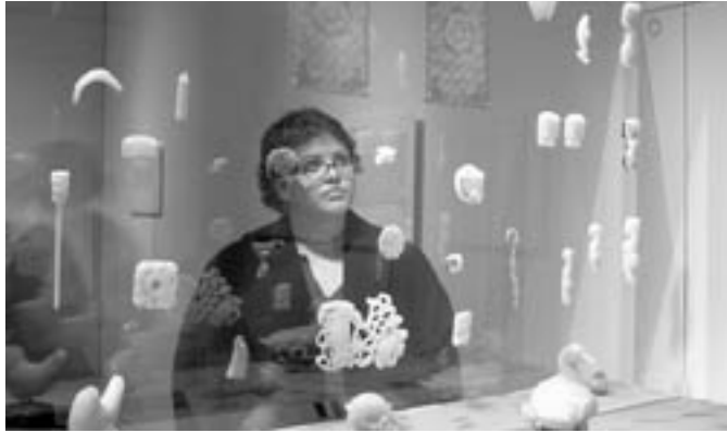
A young visitor views jade pieces in the gallery.

“We really love collaborating with SAM—it provides a great space for our youth to present their view of the world and a very public platform for the youth voice to be heard.” —Youth in Focus