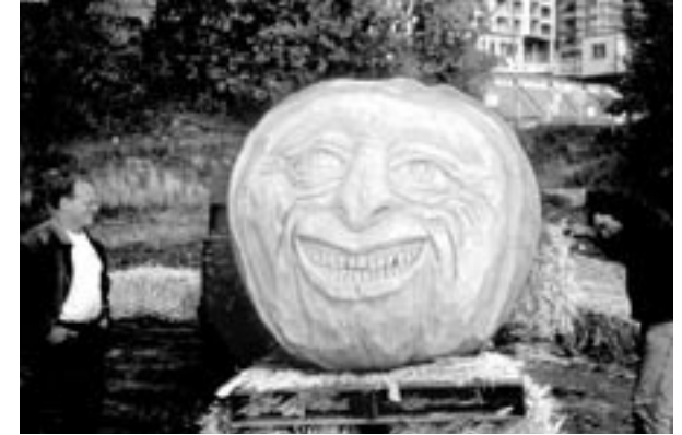
Artist Russ Leno carves an enormous pumpkin at SAM's Sunday in the Park.

THIS YEAR'S EXHIBITIONS allowed for great opportunities to reach out to a teen audience through a series of workshops. In the fall, teens created 'zines, rock posters and skateboard designs in conjunction with the Baja to Vancouver exhibition. At the end of the workshop, student work was displayed in the first floor hallway panels.